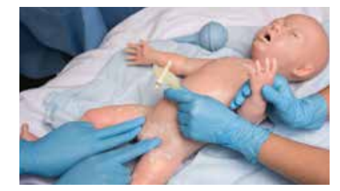
Pulses: fontanel, brachial, umbilical, and femoral

Neonatal resuscitation and stabilization