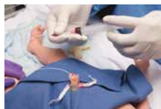
Continuous UAC/UVC infusion