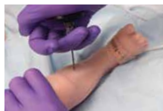
Hand and scalp IV, tibial IO