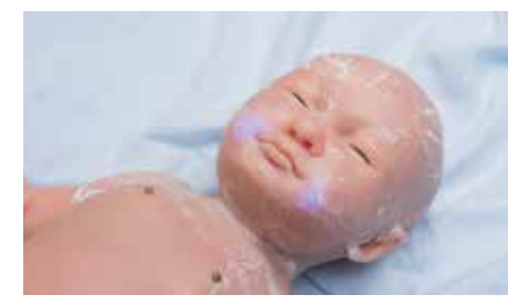
Cyanosis, jaundice, pink, and pallor