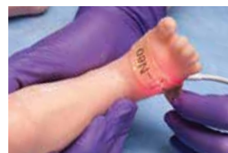
Pre- and post-ductal SpO 2