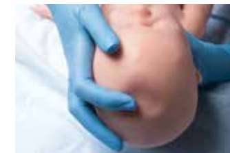
Sunken, bulging, and normal