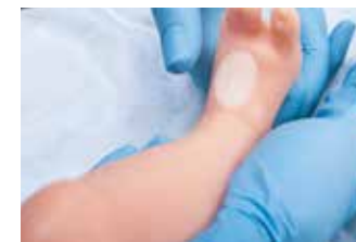
Capillary refill time testing