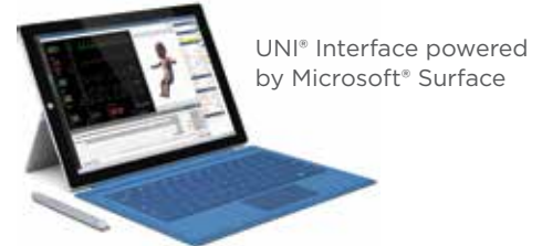
UNI® Interface powered by Microsoft® Surface