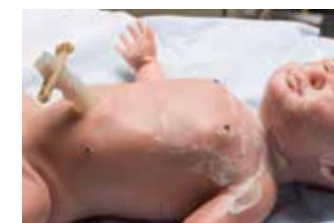
Programmable retractions, "see-saw" breathing