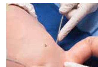
Bilateral pneumothorax sites