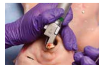
Anatomically accurate airway