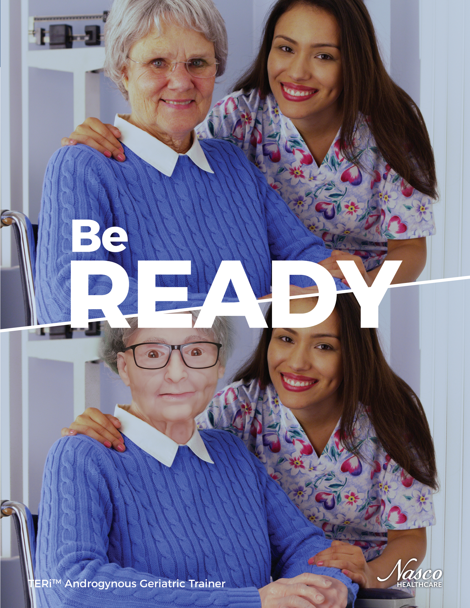
TERi™ Androgynous Geriatric Trainer

Nasco Healthcare Inc. 16 Simulaids Drive, Saugerties, NY, 12477 USA Phone: 1-833-NASCOHC (627-2642) Email: info@nascohealthcare.com www.nascohealthcare.com